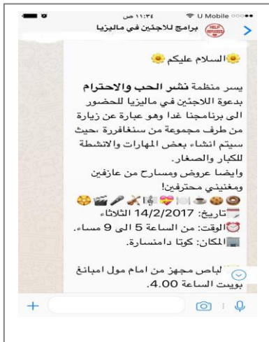
Figure 1 Invitation to attend a meeting with Singaporean delegation