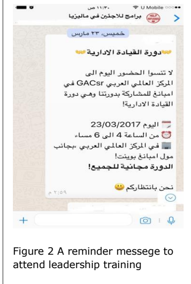
Figure 2 A reminder message to attend leadership training